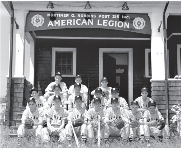
THE MAOLIS CLUB FIRST BUILT IN 1912 AMERICAN LEGION HALL PHOTOS CIRCA 1953